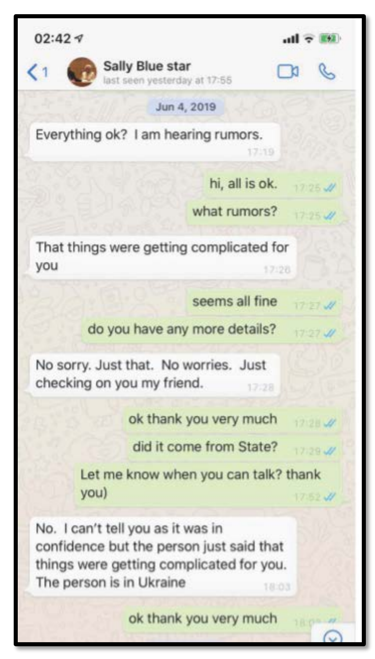
Messages exchanged between Sally Painter (white background) and Andrii Telizhenko (green background)<sup>197</sup>