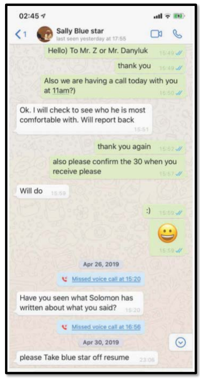
Messages exchanged between Sally Painter (white background) and Andrii Telizhenko (green background)<sup>196</sup>