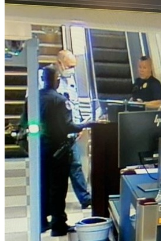
(Still shot photos taken from surveillance video)

After the defendant was sent on his way, another defacing incident was reported of the same poster outside of LHOB 1023. According to the complainant the defacing occurred between 6:00 PM and 6:05 PM hours. An 8.5" x 11" sticker that read " True Disciples of Christ don't say the thing you say, act the way you act, and treat people the way you treat people" was affixed on the poster. This is the same quote as the defacing which occurred on February 1, 2022. Reference CCN: 22-034-255