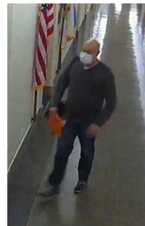
(Still shot photos taken from surveillance video)