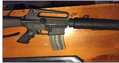
UNCLASSIFIED//FOR OFFICIAL USE ONLY