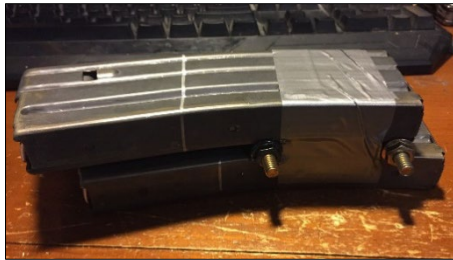
UNCLASSIFIED//FOR OFFICIAL USE ONLY