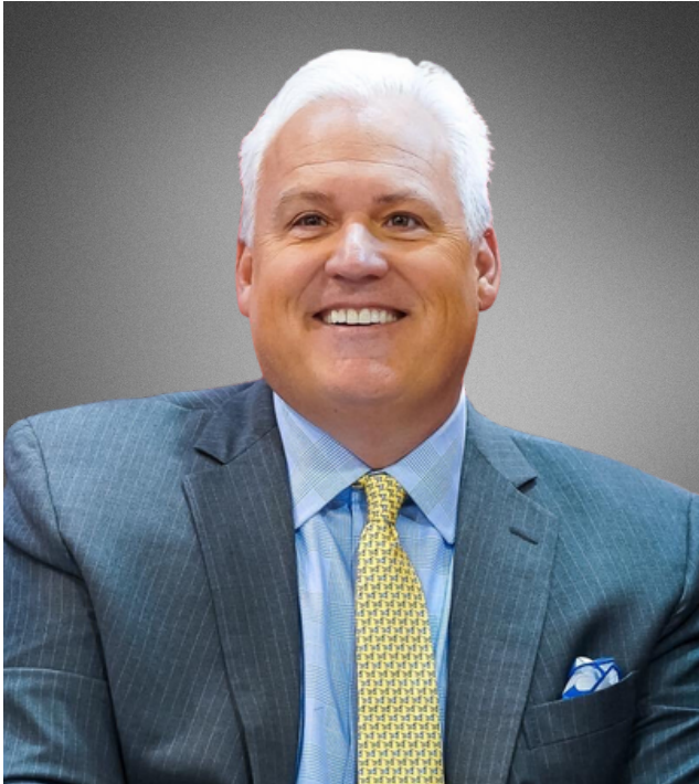
MATT SCHLAPP CHAIRMAN, CPAC