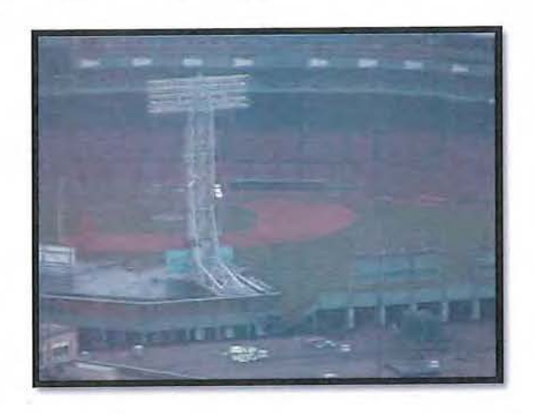
Aerial views from the Prudential Center in Boston, Massachusetts