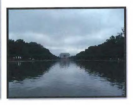
b. In addition, the following are screenshots from videos recovered from the SAAB Devices: